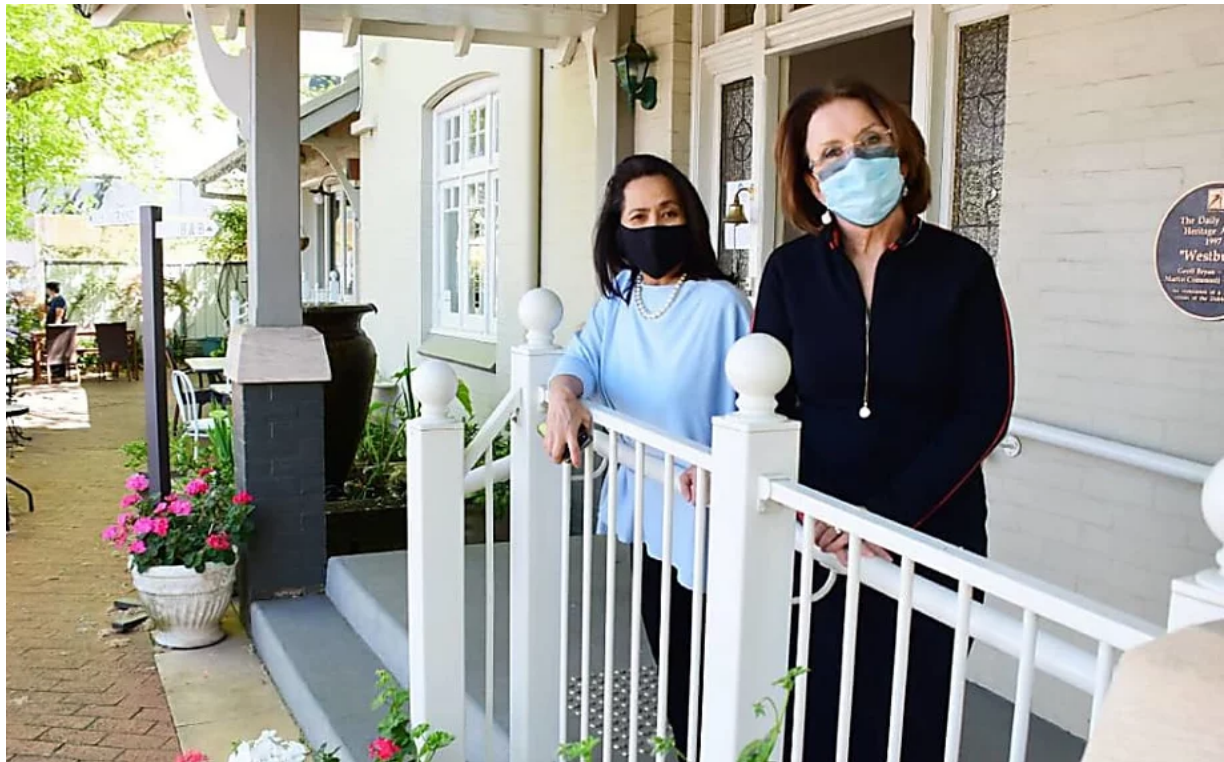
Dubbo restaurateur selling The Westbury as she prepares to say goodbye