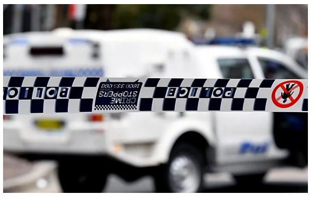
Woman dies in multi-vehicle crash east of Dubbo