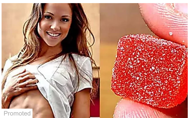
Two Gummies (Before Bed) Can Burn Your Belly Flab All Night Long! slimmingfast.net

Solar Panels: 7 in 10 Aussies Don't Know This. Live Smart Save Money