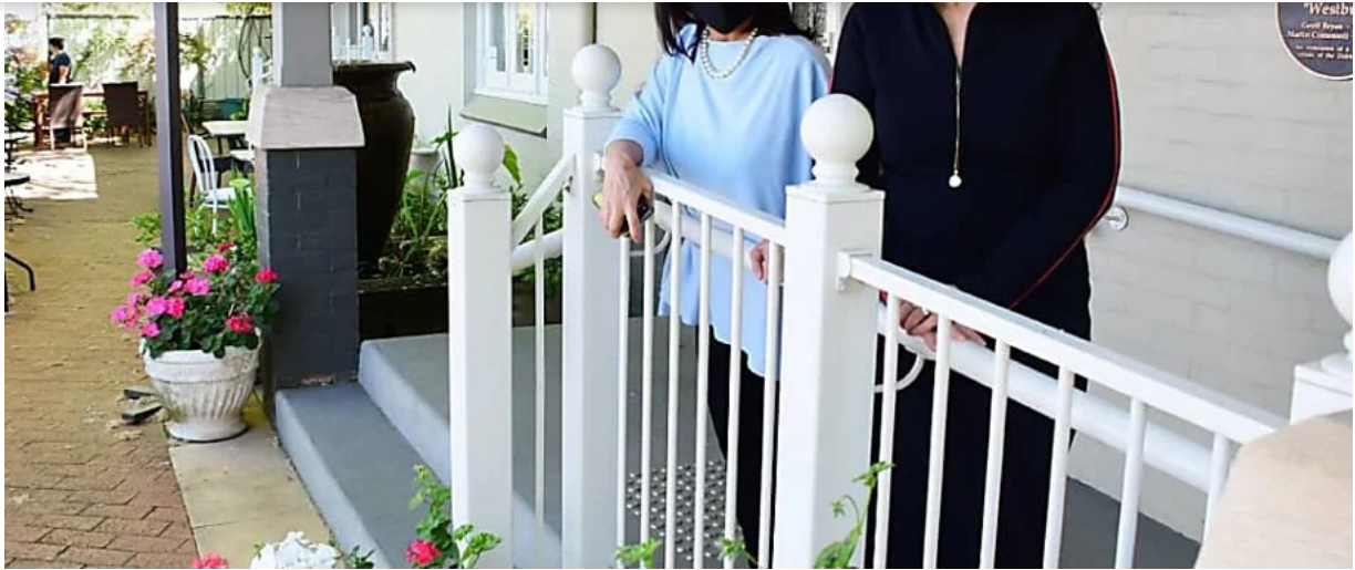
Dubbo restaurateur selling The Westbury as she prepares to say goodbye